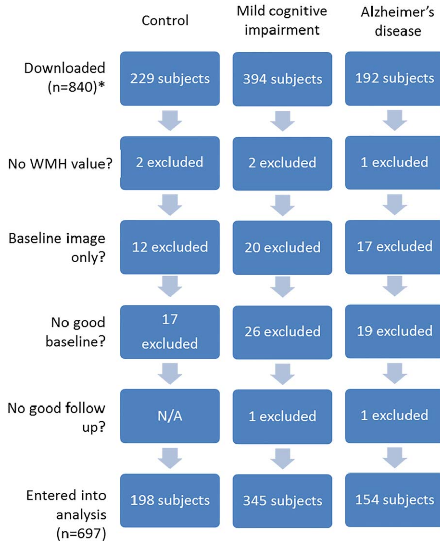
FIGURE 1. Flowchart showing the subject selection process for the cross-sectional and longitudinal analysis, by diagnostic group. *Twenty-five subjects were additionally excluded which had no available diagnosis; scans were failed at initial scan by LONI. [Color figure can be viewed at wileyonlinelibrary.com ]

underwent quality control at the Mayo Clinic (Rochester, MN) which included protocol compliance check, inspection for clinically significant medical abnormalities, and image quality assessment. Pre-processing steps using the standard ADNI image processing pipeline were then applied, including gradient warping (Jovicich et al., 2006), B1 nonuniformity (Narayana et al., 1988) and intensity nonuniformity correction (Sled et al., 1998). These preprocessed images underwent internal quality control at the Dementia Research Centre, London, UK. Images with significant motion artefacts causing severe blurring at the tissue boundaries, were excluded from this study.